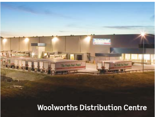
Woolworths Distribution Centre

Large rest area for up to 45 trucks and a secure area for trailer exchange between Sydney-based and Melbourne-based drivers.