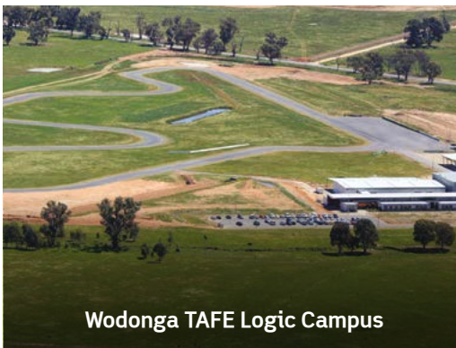
Wodonga TAFE Logic Campus